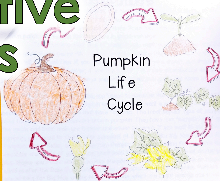
Pumpkin Life Cycle